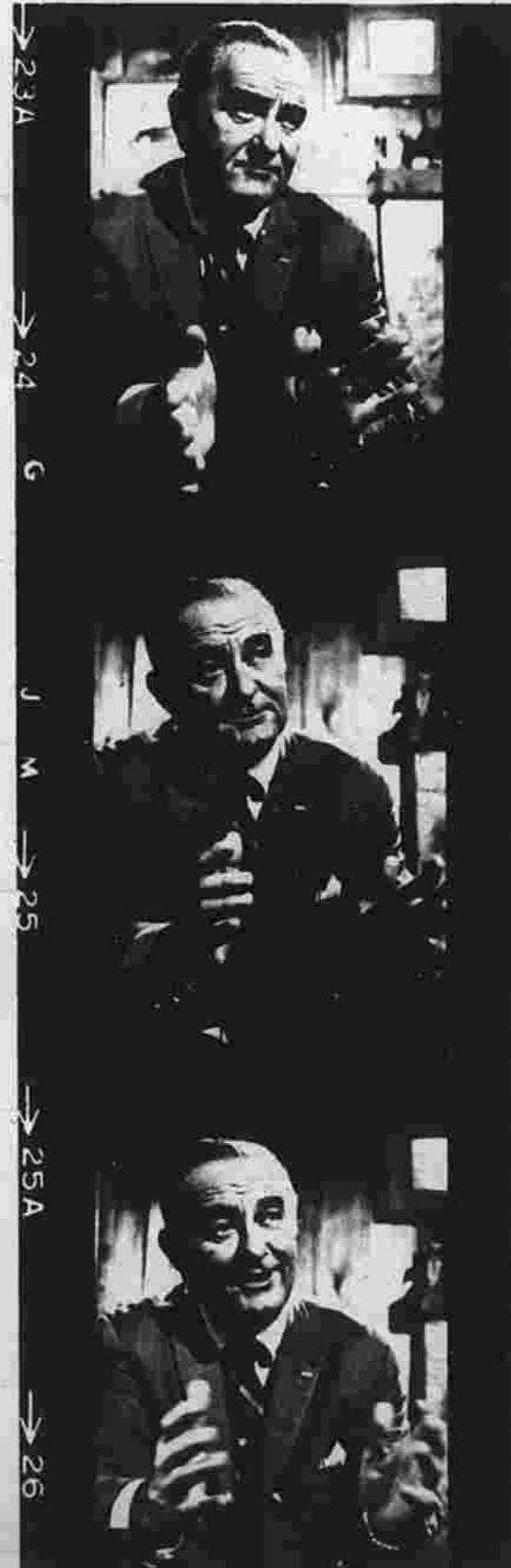
Former President Lyndon Johnson being interviewed for "LBJ: The Decision to Halt the Bombing." The CBS show is on Friday at 10 p.m.

The 90-minute special of course topped the national Nielsen ratings list for the week ending Jan. 18. The "Dean Martin Show" was second and "Mayberry R.F.D." was third. NBC came out ahead in average audiences during the period with a rating of 23.4, followed by CBS with 21.5, and ABC, 15.5.