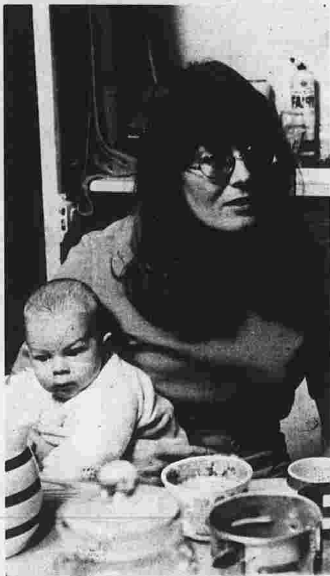
Vanessa Redgrave and son on NBC's "First Tuesday."

NBC News' "First Tuesday" will explore the life style of actress Vanessa Redgrave in next Tuesday's edition (9-11 p.m.)